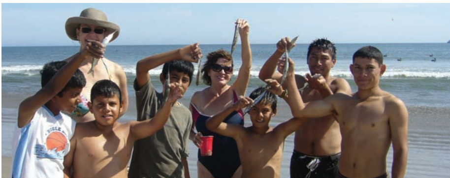
Mazatlán, Isla Piedra

I respectfully invite you to join TMSC and be part of our efforts to build international bridges with our sister cities. It has been said that volunteering is the ultimate expression of democracy. We vote during electoral times, but when we volunteer, we vote every day for the kind of community we aspire to live in.